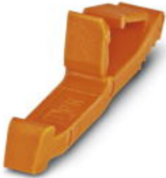
Latching, length: 29.8 mm, width: 10 mm, number of positions: 1, color: orange

Please be informed that the data shown in this PDF Document is generated from our Online Catalog. Please find the complete data in the user's documentation. Our General Terms of Use for Downloads are valid ( http://phoenixcontact.com/download )