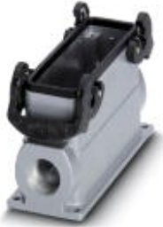
HEAVYCON box mounting base B24, with double locking latch, height 84 mm, with support 2xM32

Please be informed that the data shown in this PDF Document is generated from our Online Catalog. Please find the complete data in the user's documentation. Our General Terms of Use for Downloads are valid ( http://phoenixcontact.com/download )