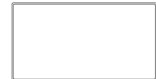
Steel wire perimeter reinforcing frame for extra strength and durability