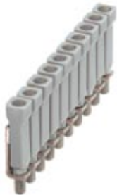
Jumper, Number of positions: 10, Color: gray

Please be informed that the data shown in this PDF Document is generated from our Online Catalog. Please find the complete data in the user's documentation. Our General Terms of Use for Downloads are valid ( http://download.phoenixcontact.com )