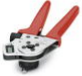
Crimping pliers with digital display

Crimping pliers with digital display - SF-Z0025 - 1607452