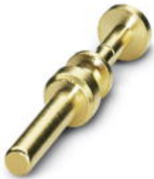
Crimp contact, turned, Single contact, Contact diameter: 3.6 mm, Crimp range: 4 mm 2 ...6 mm 2

Please be informed that the data shown in this PDF Document is generated from our Online Catalog. Please find the complete data in the user's documentation. Our General Terms of Use for Downloads are valid ( http://download.phoenixcontact.com )