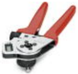
Crimping pliers with digital display

Crimping pliers with digital display - SF-Z0026 - 1607454