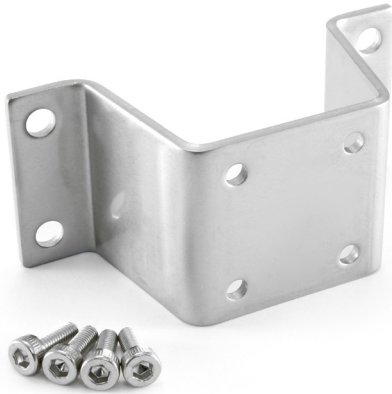
Bracket, with 4 pcs of M3 A2 screws

Wall bracket used with Low Pim Power Splitters in 2 Way, 3 Way and 4 Way models.