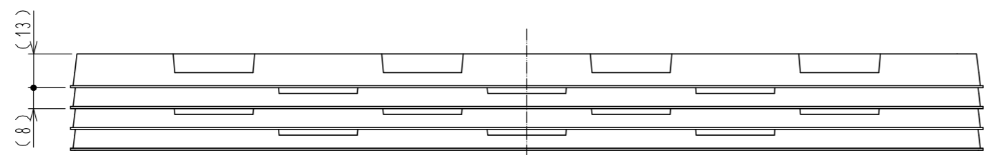
Fig.4 Stacked tray drawing (1:2)