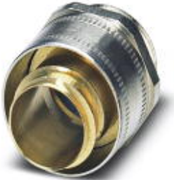
Cable gland made from brass with Pg thread, rotatable, IP40 protection

Please be informed that the data shown in this PDF Document is generated from our Online Catalog. Please find the complete data in the user's documentation. Our General Terms of Use for Downloads are valid ( http://phoenixcontact.com/download )