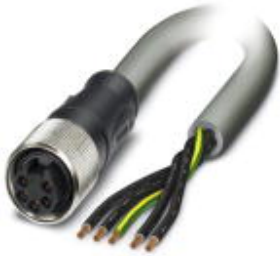
Power cable, 5-pos., gray PVC, 2.5 mm 2 , free cable end to straight 7/8" 16UNF socket, length: 3.0 m

Please be informed that the data shown in this PDF Document is generated from our Online Catalog. Please find the complete data in the user's documentation. Our General Terms of Use for Downloads are valid ( http://download.phoenixcontact.com )