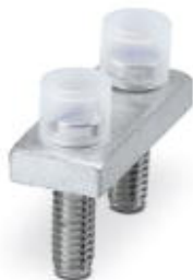
Fixed bridge, pitch: 20 mm, number of positions: 2, color: silver

Please be informed that the data shown in this PDF Document is generated from our Online Catalog. Please find the complete data in the user's documentation. Our General Terms of Use for Downloads are valid ( http://phoenixcontact.com/download )