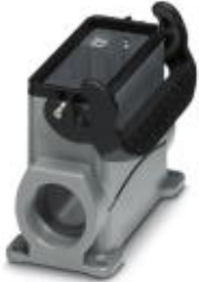
HEAVYCON box mounting base B16, with single locking latch, height 84 mm, with support 1xM32

Please be informed that the data shown in this PDF Document is generated from our Online Catalog. Please find the complete data in the user's documentation. Our General Terms of Use for Downloads are valid ( http://phoenixcontact.com/download )