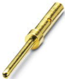
D-SUB crimp contact, connection method: Crimp connection, connection cross section: AWG 28- 22, High Density

Please be informed that the data shown in this PDF Document is generated from our Online Catalog. Please find the complete data in the user's documentation. Our General Terms of Use for Downloads are valid ( http://phoenixcontact.com/download )