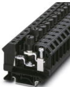
Fuse terminal block for cartridge fuse insert, cross section: 0.5 - 16 mm 2 , AWG: 24 - 6, width: 12 mm, color: black

Please be informed that the data shown in this PDF Document is generated from our Online Catalog. Please find the complete data in the user's documentation. Our General Terms of Use for Downloads are valid ( http://phoenixcontact.com/download )