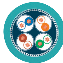
Ethernet 10 Gbit [94F]