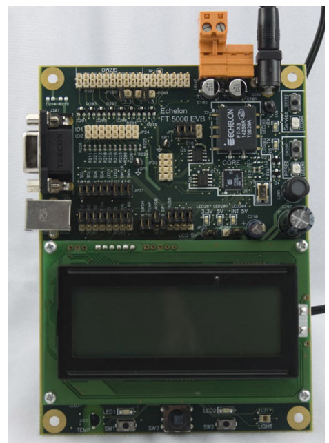
FT 5000 EVB Evaluation Board

Two FT 5000 EVB Evaluation Boards are included with the NodeBuilder FX/FT Development Tool and the NodeBuilder FX/FT Classroom Edition. The FT 5000 EVB is a complete Series 5000 LonWorks device that you can use to evaluate the LonWorks 2.0 platform and create LonWorks 2.0 devices. The FT 5000 EVB includes an FT 5000 Smart Transceiver with an external 10MHz crystal (you can adjust the internal system clock speed from 5MHz to 80MHz), an FT-X3 communication transformer, 64KB external serial EEPROM and flash memory devices, and a 3.3V power source.