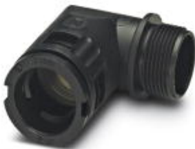
Cable gland, Pg thread, IP68/69k protection, angled

Please be informed that the data shown in this PDF Document is generated from our Online Catalog. Please find the complete data in the user's documentation. Our General Terms of Use for Downloads are valid ( http://phoenixcontact.com/download )