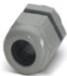
Cable gland, Cable gland material: Polyamide 6, External cable diameter 15 mm ... 21 mm, Shielding: No, Connecting thread: M32, Color: silver-gray RAL 7001

Cable gland - G-INS-M32-M68N-PNES-GY - 1411127