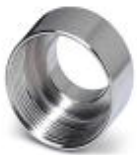
Step-up adapter, M32 to M40, including O-ring

Extension adapter - ENLAR-M-KV-M32/M40 - 1647682