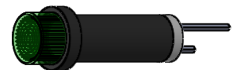
ISOMETRIC VIEW ONLY FOR REF.

The information in this document is the exclusive PROPRIETARY property of VISUAL COMMUNICATIONS COMPANY, LLC. It is disclosed with the understanding that acceptance or review by the recipient constitutes an undertaking by the recipient: (1) to hold this information in strict confidence (2) not to disclose, duplicate, copy, or use the information, in whole or in part, for any purpose other than that for which disclosed