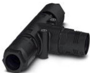
QUICKON T-distributor, black, 4+PE-pos., 2.5 mm 2 ... 6.0 mm 2 /690 V/40 A, for cable diameter of 9 mm ... 14 mm, with two QUICKON nuts

Please be informed that the data shown in this PDF Document is generated from our Online Catalog. Please find the complete data in the user's documentation. Our General Terms of Use for Downloads are valid ( http://phoenixcontact.com/download )