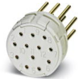
Contact insert, Number of positions: 12, Type of contact: Socket, Solder-in connection

Please be informed that the data shown in this PDF Document is generated from our Online Catalog. Please find the complete data in the user's documentation. Our General Terms of Use for Downloads are valid ( http://phoenixcontact.com/download )