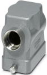
HEAVYCON sleeve housing B10, for single locking latch, height 72 mm, with support 1x M25, lateral conductor exit

Please be informed that the data shown in this PDF Document is generated from our Online Catalog. Please find the complete data in the user's documentation. Our General Terms of Use for Downloads are valid ( http://download.phoenixcontact.com )