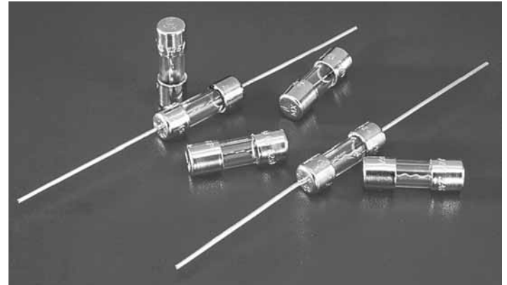
225 000 Series

Contact Littelfuse concerning other ampere ratings.