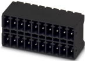
The figure shows a 10-pos. version with 20 contacts

Please be informed that the data shown in this PDF Document is generated from our Online Catalog. Please find the complete data in the user's documentation. Our General Terms of Use for Downloads are valid ( http://phoenixcontact.com/download )