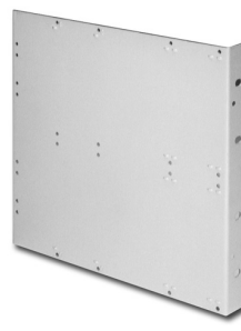
With EIA Flange