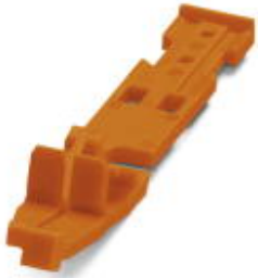
Latching, length: 59 mm, width: 6.8 mm, color: orange

Please be informed that the data shown in this PDF Document is generated from our Online Catalog. Please find the complete data in the user's documentation. Our General Terms of Use for Downloads are valid ( http://phoenixcontact.com/download )