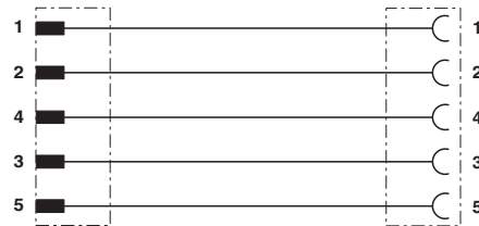
Contact assignment of the 7/8" connector and the 7/8" socket