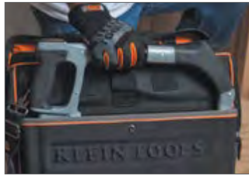
Top-loading hacksaw pocket with protective plastic lining.