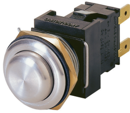
H8300RP - - -