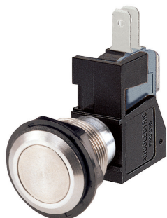
C0911VA - - -