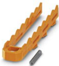
Component housing, length: 77 mm, Lock and Release system, color: orange, width: 16.2 mm

Please be informed that the data shown in this PDF Document is generated from our Online Catalog. Please find the complete data in the user's documentation. Our General Terms of Use for Downloads are valid ( http://phoenixcontact.com/download )