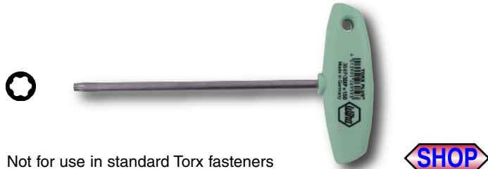
Not for use in standard Torx fasteners

364 TORXPlus® Screwdriver, With Wiha-T-handle Blade high alloy chrome-vanadium-molybdenum steel, hardened, hard chromed. Wiha-T-handle high quality plastic, impact resistant.