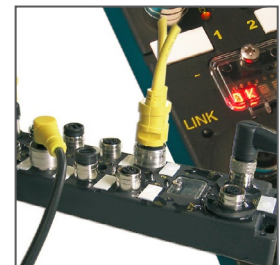
Smart I/O modules