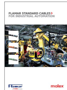
Flamar standard cables for industrial automation brochure English 987651-3992 Chinese 987651-4141