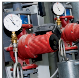
Sensors, valves and control cabinets