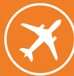
Aerospace & Defense