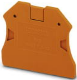
End cover, length: 47 mm, width: 2.2 mm, height: 39.8 mm, color: orange

Please be informed that the data shown in this PDF Document is generated from our Online Catalog. Please find the complete data in the user's documentation. Our General Terms of Use for Downloads are valid ( http://phoenixcontact.com/download )