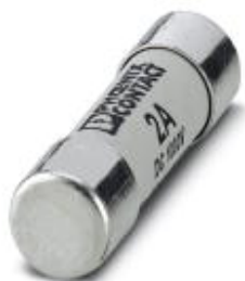
Fuse, 10.3x38 mm, up to 1000 V DC, gPV characteristics

Please be informed that the data shown in this PDF Document is generated from our Online Catalog. Please find the complete data in the user's documentation. Our General Terms of Use for Downloads are valid ( http://phoenixcontact.com/download )