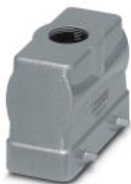
HEAVYCON B16 sleeve housing, for double locking latch, height: 76 mm, with 1 x M32 thread, straight cable outlet

Please be informed that the data shown in this PDF Document is generated from our Online Catalog. Please find the complete data in the user's documentation. Our General Terms of Use for Downloads are valid ( http://phoenixcontact.com/download )