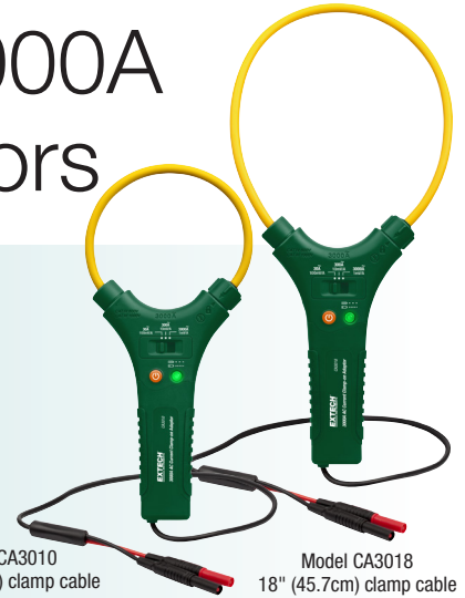
Model CA3010 10" (25.4cm) clamp cable

Expand your meter's capabilities to measure AC Current up to 3000A. Fit most MultiMeters or Clamp Meters with standard shrouded banana plug sockets. Flexible clamp jaw easily wraps around bus bars and cable bundles where standard clamp adaptors and meters can't. The thin 7.5mm cable diameter easily fits into tight spaces. Choose between a 10" (25.4cm) or 18" (45.7cm) clamp cable length.