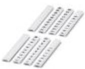
Zack Marker strip, flat, can be ordered: Strip, white, labeled according to customer specifications, Mounting type: Snap into flat marker groove, for terminal block width: 5 mm, Lettering field: 5.15 x 5.15 mm

Zack Marker strip, flat - ZBF 5 CUS - 0825025