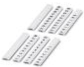
Zack Marker strip, flat, Strip, white, labeled, Printed horizontally: Consecutive numbers 1 - 10, 11 - 20, etc. up to 491 - 500, Mounting type: Snap into flat marker groove, for terminal block width: 5 mm, Lettering field: 5.15 x 5.15 mm

Zack Marker strip, flat - ZBF 5,LGS:FORTL.ZAHLEN - 0808671