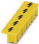
Warning cover, 5-pos., for terminal width: 5.2 mm

Zack Marker strip, flat - ZBF 5 CUS - 0825025