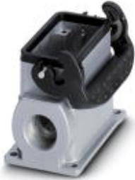
HEAVYCON box mounting base B10, with single locking latch, height 74 mm, with supports 1xM32

Please be informed that the data shown in this PDF Document is generated from our Online Catalog. Please find the complete data in the user's documentation. Our General Terms of Use for Downloads are valid ( http://phoenixcontact.com/download )